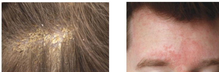
Figures: Seborrheic Dermatitis

Seborrheic dermatitis is a common skin disease that is estimated to occur in more than 10 million people in the United States. The disease causes red patches covered with large, greasy, flaking yellow-gray scales, and is frequently itchy. It appears most often on the scalp, face (especially on the nose, eyebrows, ears, and eyelids), upper chest, and back as depicted in the figures below. While the pathogenesis of seborrheic dermatitis is not well understood, it is an inflammatory disease of the skin distinct from atopic dermatitis and psoriasis, it shares some features such as a skin barrier defect with atopic dermatitis and some inflammatory pathways in common with psoriasis. Seborrheic dermatitis is associated with an over-abundance of Malassezia , a naturally occurring yeast found on normal skin but found in excess numbers on skin with seborrheic dermatitis where it may exacerbate the underlying skin inflammation that leads to the signs and symptoms well characterized in the disease. Seborrheic dermatitis can occur in adults, adolescents and infants, and in infants is commonly referred to as “cradle cap”.