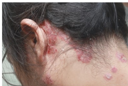
Figures: Scalp Psoriasis