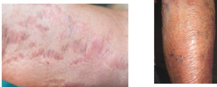
Figures: Steroid-induced striae (left) and Steroid-induced skin atrophy (right)