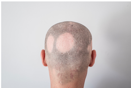
Figure: Alopecia Areata

Alopecia areata is an autoimmune condition that affects about 1 in 500 adults. In alopecia areata, the immune system attacks the body's own hair follicles—leading to patches of hair loss on the scalp, face, and other areas of the body. Typically, these bald patches appear suddenly and in some patients, can involve the whole body. Recurrence is common and most sufferers will have several episodes during their lifetimes. A small percentage of patients have persistent hair loss even with treatment. Alopecia areata has been shown to lead to significant psychosocial impacts in patients, negatively impacting self-esteem, body image, and/or self-confidence.