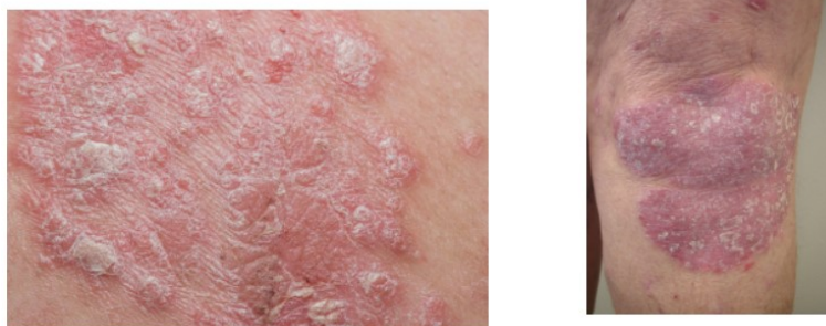
Figures: Plaque Psoriasis

impact sleep patterns. In addition, patients with plaque psoriasis can suffer substantial psychosocial impacts from their disease and have a 50% greater chance of depression than the general population.