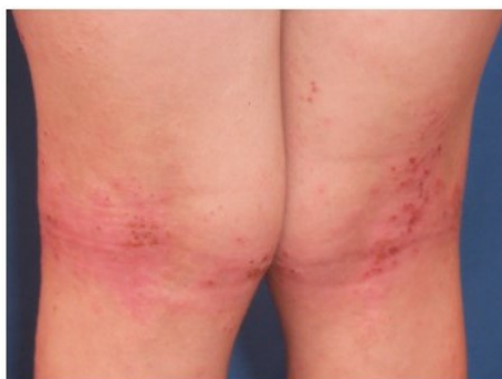
Figures: Atopic Dermatitis

Atopic dermatitis is the most common type of eczema, affecting approximately 26 million people in the United States. Atopic dermatitis is the most common skin disease among children, with prevalence steadily increasing from 8% to 12% in the last two decades. Atopic dermatitis is characterized by a defect in the skin barrier, which allows allergens and other irritants to enter the skin, leading to an immune reaction and inflammation. This reaction produces a red, itchy rash, most frequently occurring on the face, arms and legs, and the rash can cover significant areas of the body (see figures below). The rash causes significant pruritus (itching), which can lead to damage caused by scratching or rubbing and perpetuating an 'itch-scratch' cycle.