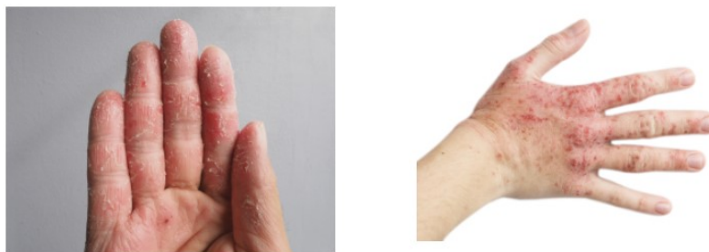
Figures: Hand Eczema