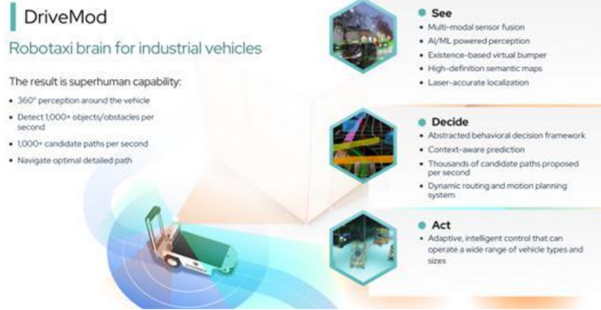
Figure 1: Overview of Cyngn's autonomous vehicle technology (DriveMod)

DriveMod's flexibility combines with our network of manufacturing and service partners to support customers at different stages of autonomous technology integration. This allows customers to grow the complexity and scope of their industrial autonomy deployments as their business transforms while continually capturing returns throughout their transition to full autonomy. EAS will also grant customers access to over-the-air software upgrades, ad hoc customer support, and flexible consumption based on usage and scale of operations. By lessening both the commercial and technical burdens of traditional vehicle automation and industrial robotics investments, industrial AVs can become universally available to the market, even reaching small and medium-sized businesses that may otherwise struggle to adopt Industry 4.0 and 5.0 technology.