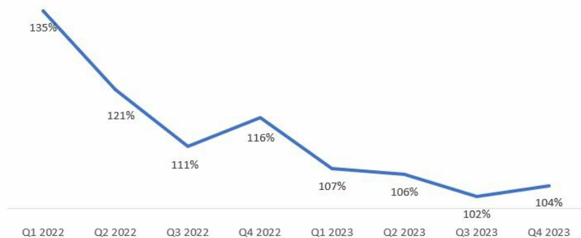
Dollar-based Net Expansion Rate Over Time